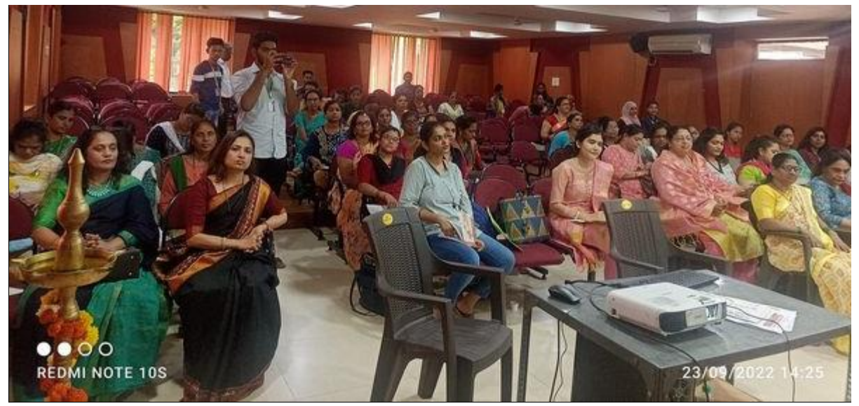
Women Entrepreneurs from Palghar District